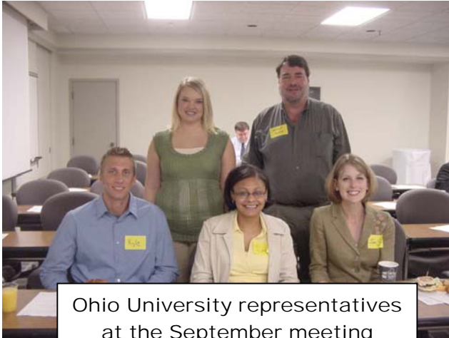
Ohio University representatives at the September meeting