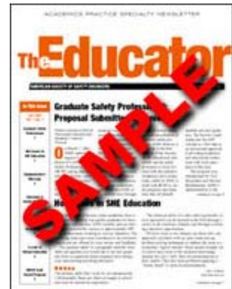
Sample newsletter for the Academics Practice Specialty